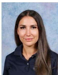
Michelle McGinley ES - Various Locations