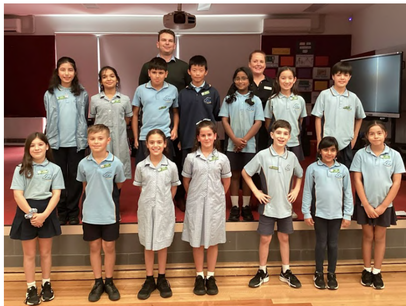
Our 2024 Green Team Captains from Grades 4 and 5