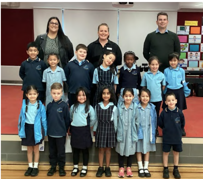
Our 2024 Class Captains from Grade 1